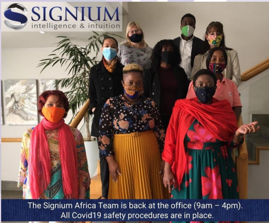
The Signium Africa Team is back at the office (9am – 4pm). All Covid19 safety procedures are in place.

Getting back to the office has us excited. As of 4 September we are officially working from the office with all the COVID19 precautions in place. It's great to have our team under one roof.